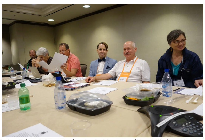
The Spouses at Eureka